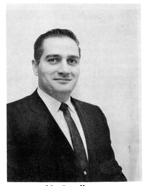
New Hoosier SERVANT

5. The recent fireball which appeared over the northeastern United States was a meteorite. A comet is identified by a glowing tail as it passes the sun. Some comets travel with our solar system and are seen at periodic intervals; others are observed but once as they pass through our solar system. A meteorite, however, actually penetrates the earth's atmosphere. Friction causes the piece of rock or metal to glow fiercely until it strikes the earth's surface.